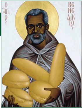
St. Benedict the Black