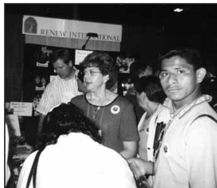
Registration at previous Institute